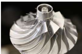
1. Compressor wheel