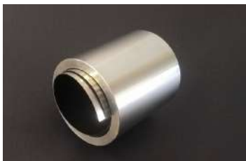
3. Air bearing