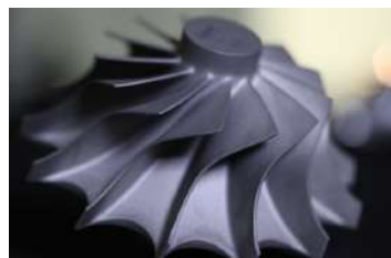
2. Turbine wheel